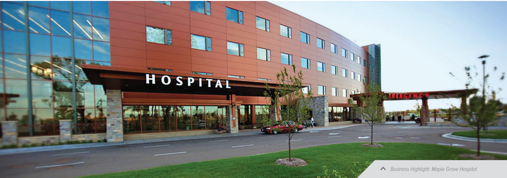
Business Highlight: Maple Grove Hospital